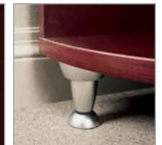
Adjustable feet are standard on all pedestal and storage components and are offered in Silver or Black Nickel